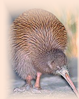
Left: Kiwi This native New Zealand bird is flightless and nocturnal.